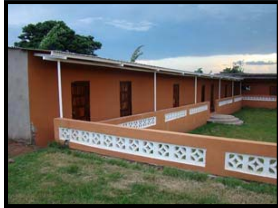
Today almost complete