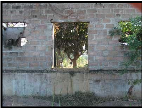
The front entrance originally