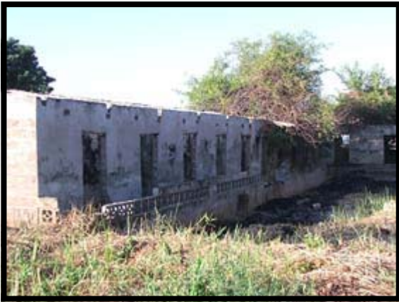
The East Wing Before

One of the big projects of the latter half of 2008 was the east wing. The new wing will hold a preschool bedroom with 5 bunks and a nanny's bed, a library and reading room, an infirmary and medical closet and two staff rooms. This will free up more beds for new babies—we look to take in five more in 2009.