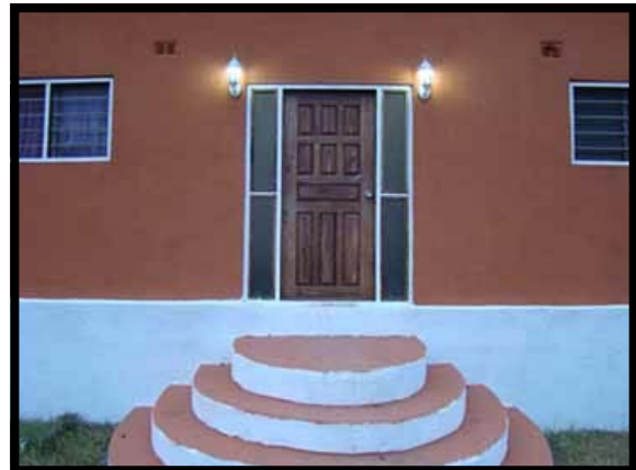
The new entrance!